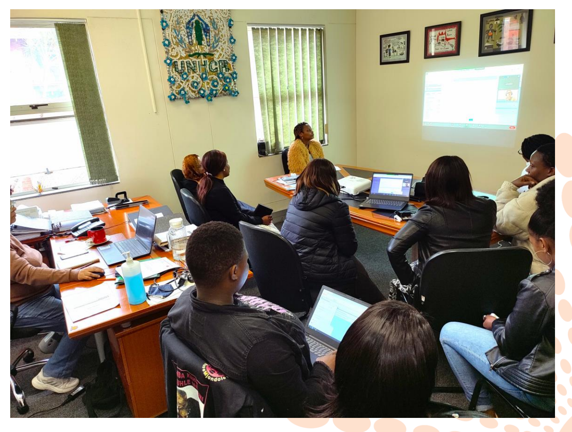
RSS Teams in training session with Australian Volunteer Graham.

Working with national volunteers to capture and implement use