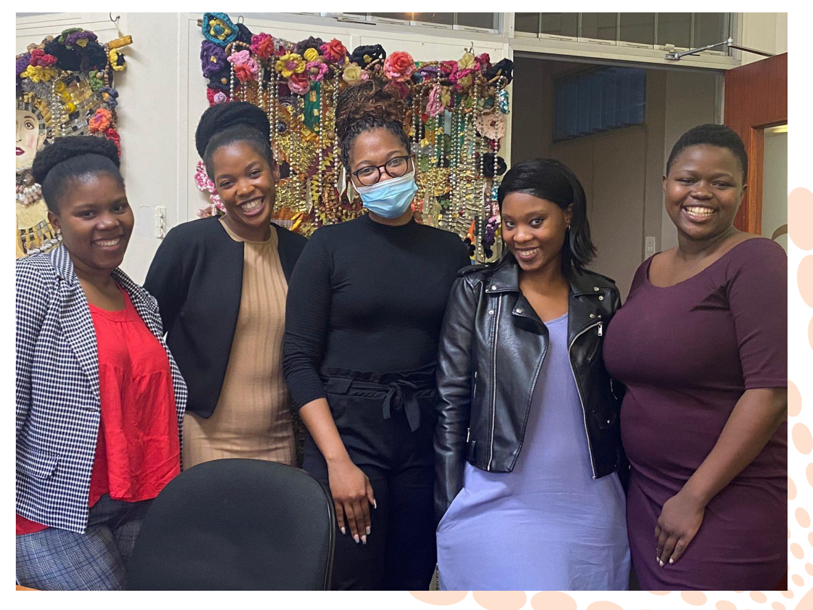
National Volunteers and Peer at RSS office.

Social worker, finance administrator, 2 SF administrators