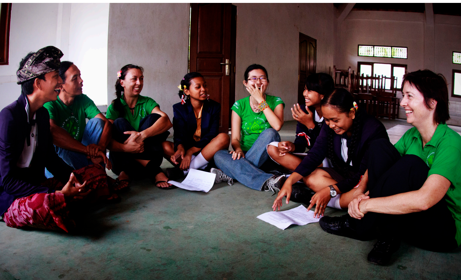
AVI volunteer and colleagues, Indonesia.