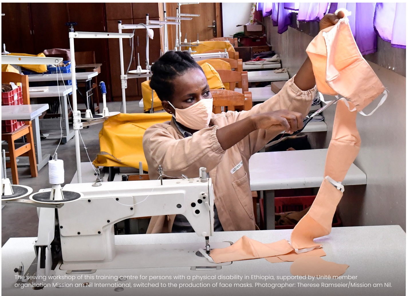
The sewing workshop of this training centre for persons with a physical disability in Ethiopia, supported by Unité member organisation Mission am Nil International, switched to the production of face masks.