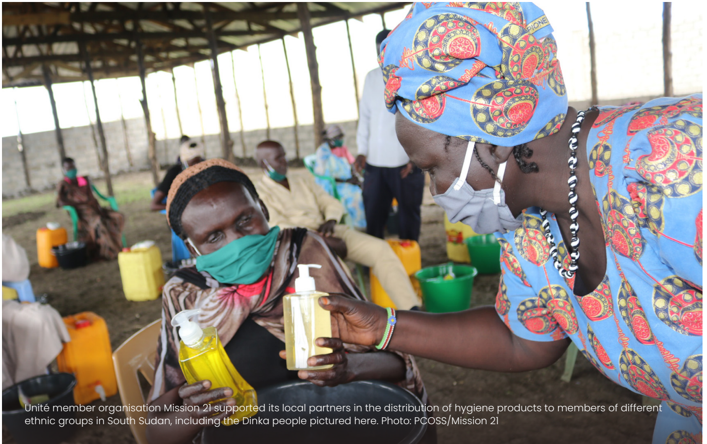
Unité member organisation Mission 21 supported its local partners in the distribution of hygiene products to members of different ethnic groups in South Sudan, including the Dinka people pictured here.