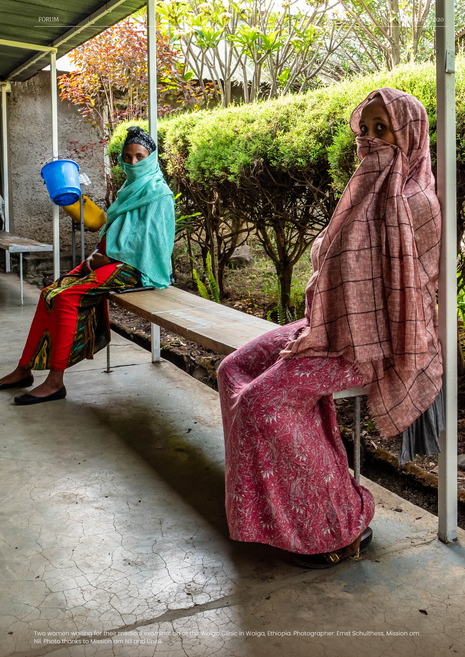
Two women waiting for their medical examination at the Walga Clinic in Walga, Ethiopia.