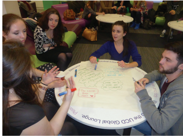
Returned volunteers taking part in a Skills in Development Education course.