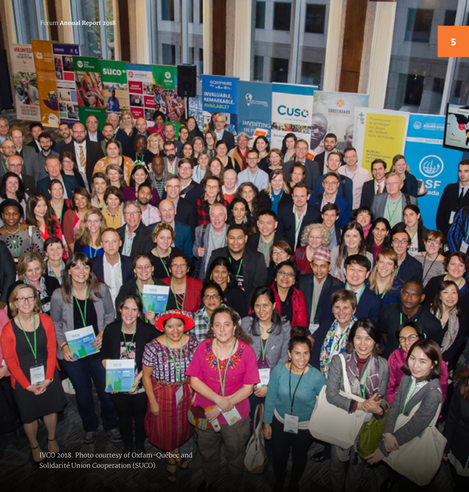
IVCO 2018.