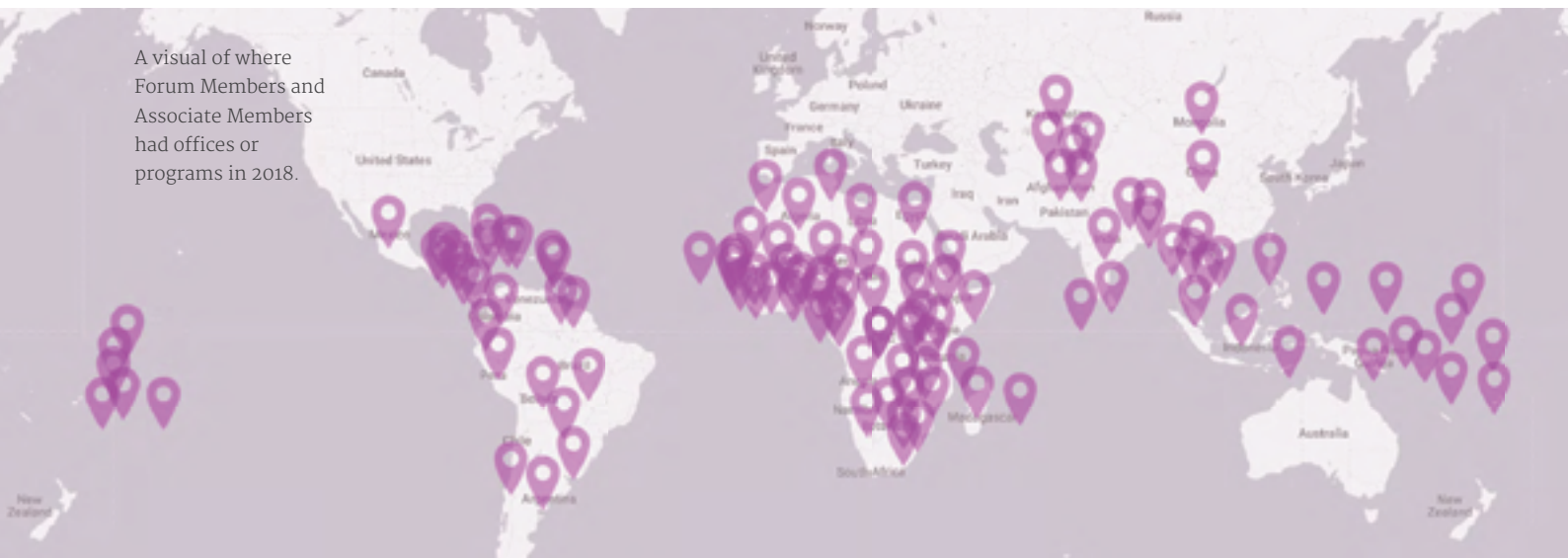
A visual of where Forum Members and Associate Members had offices or programs in 2018.